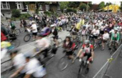
As of yesterday, one million cyclists have taken part in 20 years of cycling events, including the Tour de l'ile, Tour des enfants and Tour du nuit.