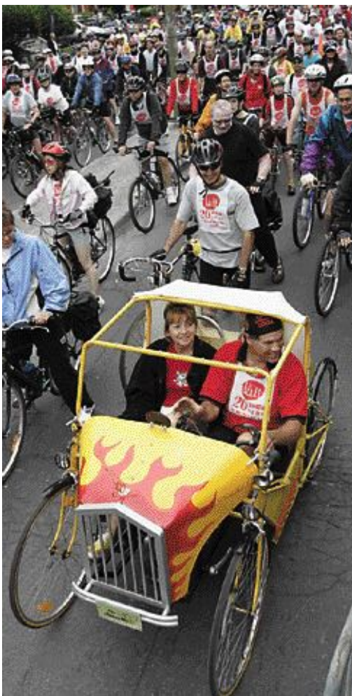
Not all vehicles were two-wheelers at yesterday's event.

But those wishing a tougher ride should sign up for cycling events called Summer Defi, each with distances varying from 75